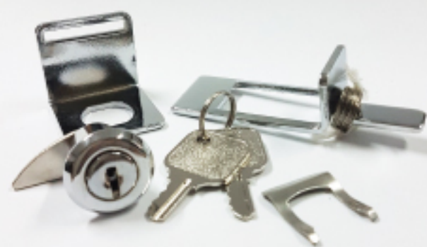
MKGIMA001 / BJ-126

Weight : 47.1 gr Material : Zamak 3 Key Set : 895 B plat (2 Pcs)