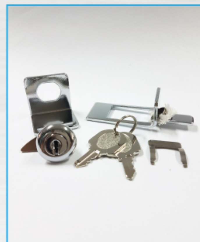
KEY ASSY 896 / BJ-135

Weight : 33.6 gr Material : Zamak 3 Key Set : 894 P (2 Pcs)