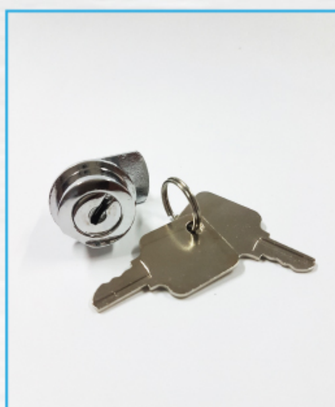
DOORLOCK ASSY R-69 / BJ-129

Weight : 43 gr Material : Zamak 3 Key Set : 895 B Plat (2 Pcs)