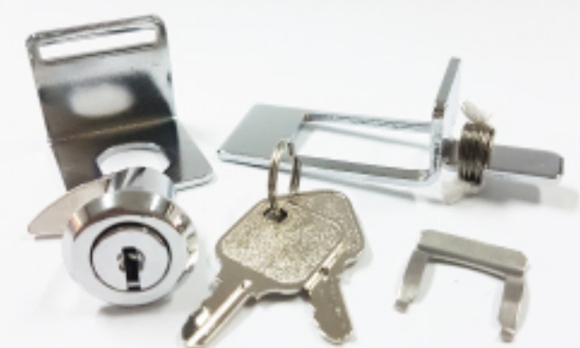
MKGIMA002 / BJ-127

Weight : 80.9 gr Material : Zamak 3 Key Set : 895 B Alloy (2 Pcs), Spring Lock Pin (1 Pcs) Key Spring Seat (1 Pcs), Key Holder (1 Pcs) Pin Lock Key (1 Pcs)