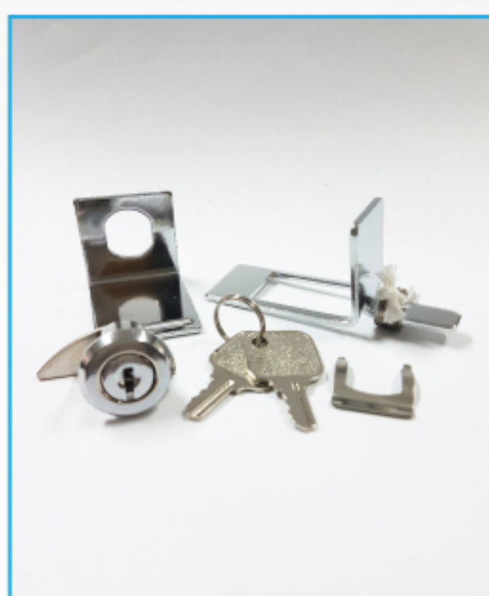
MKGIMA004 / BJ-133

Weight : 76.5 gr Material : Zamak 3 Key Set : 895 B Alloy (2 Pcs), Spring Lock Pin (1 Pcs) Key Spring Seat (1 Pcs), Key Holder (1 Pcs) Pin Lock Key (1 Pcs)