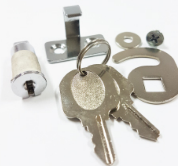
DOOR LOCK ASSY 891 F / BJ-131

Weight : 69.1 gr Material : Zamak 3 Key Set : 895 B Alloy (2 Pcs), Spring Lock Pin (1 Pcs) Key Spring Seat (1 Pcs), Key Holder (1 Pcs) Pin Lock Key (1 Pcs)