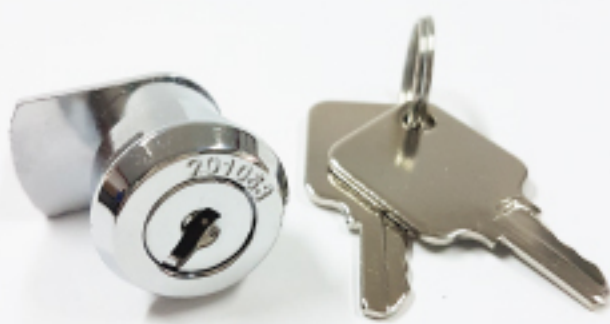
Door Lock Assy 891 / BJ-125

DIE, CASTING, PUNCHING, PLATING, PRODUCTS MANUFACTURING