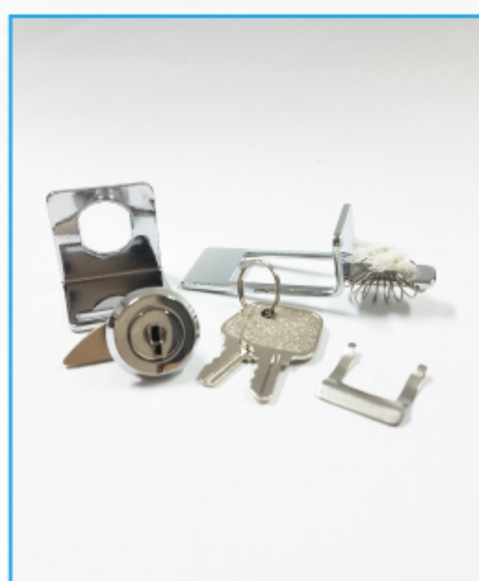
MKGIMA003 / BJ-128

Weight : 69.2 gr Material : Zamak 3 Key Set : 896 B (2 Pcs), Spring Lock Pin (1 Pcs) Key Spring Seat (1 Pcs), Key Holder (1 Pcs) Pin Lock Key (1 Pcs)