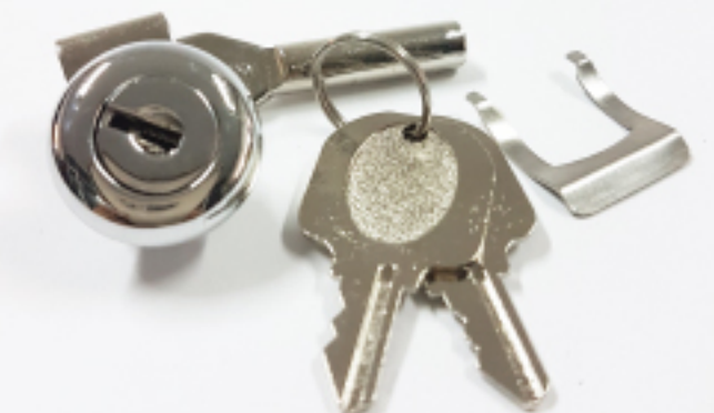
LOCK ASSY 883 / BJ-132

Weight : 28.4 gr Material : Zamak 3 Key Set : 896 B (2 Pcs), Ring Penahan (1 Pcs) Ring screw (1 Pcs), Lock Hook Lokal (1 Pcs)