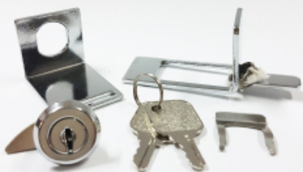
MKGIMA005 / BJ-134

Weight : 86.6 gr Material : Zamak 3 Key Set : 895 B Alloy (2 Pcs), Spring Lock Pin (1 Pcs) Key Spring Seat (1 Pcs), Key Holder (1 Pcs) Pin Lock Key (1 Pcs)